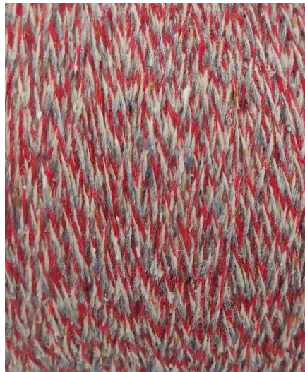
50 Rojo Red