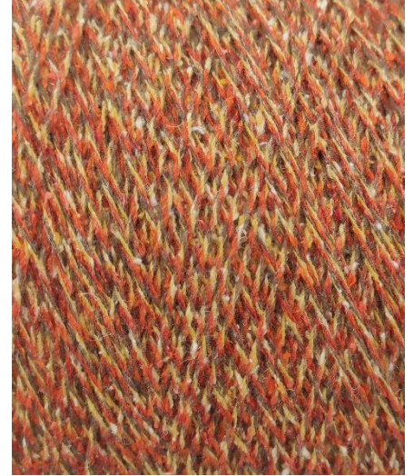
30 Tostado Orange