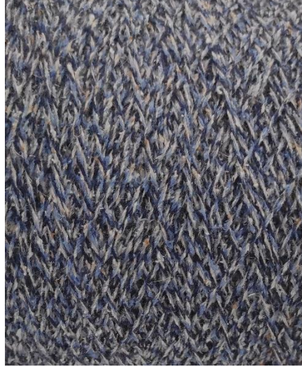
20 Azul Blue