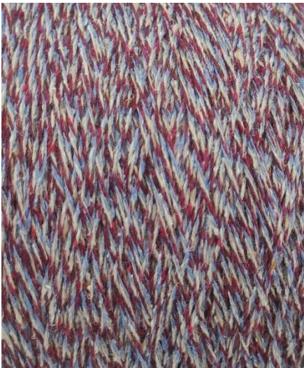
40 Morado Purple